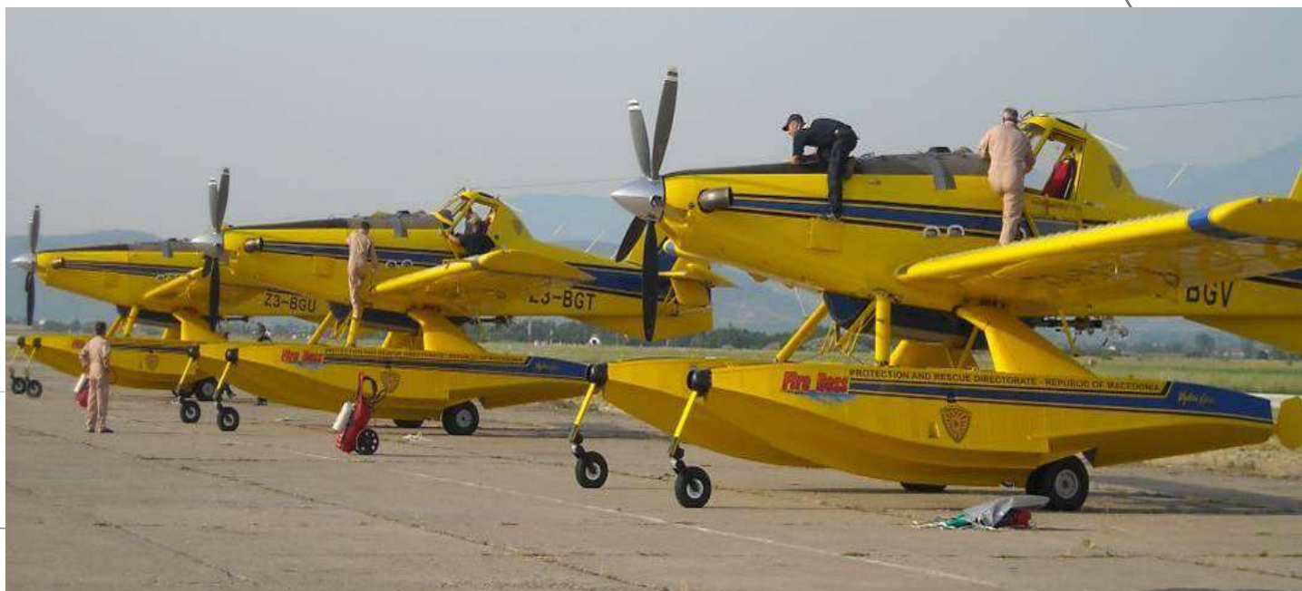
Air Tractor Fire Boss AT - 802