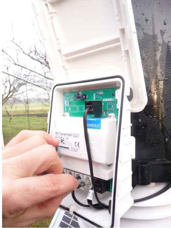
Figure 2 – WAHASTRAT acquisition station

WAHASTRAT system, like most environmental monitoring systems uses a distributed sensor-based framework (WSN), and IoT connects them to the Internet to make data available at all times. The main roles of these systems are monitoring time series, data tracking, and recording. In WAHASTRAT system we implement IoT concept combined with GIS to feed the information system or to use data in real-time and spatial context, (Figure 3) WAHASTRAT GoT.